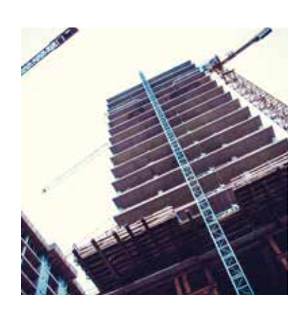
BUILDING STAGES PG 17