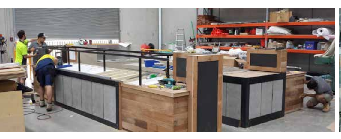
Biblos Highpoint Shopping Centre. Installation of a feature protruding puck wall system.